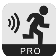
Bleep Test Pro