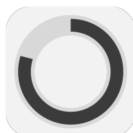
Bleep Test HD